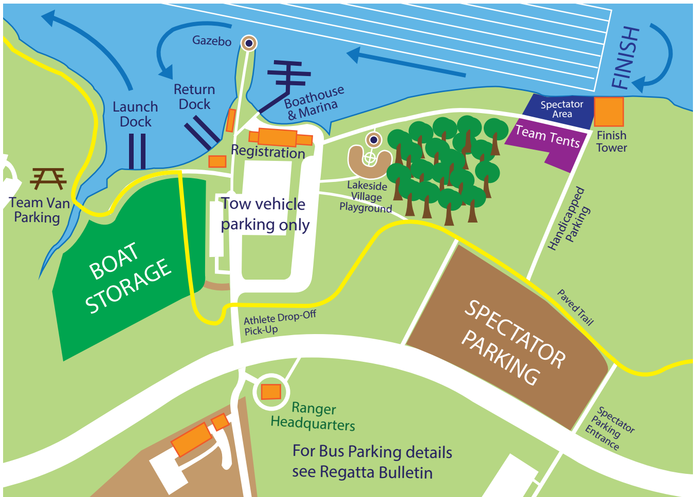
MERCER COUNTY PARK: CREW EVENT MAP