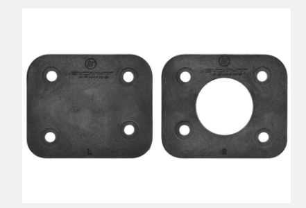
Drive QRS Steering Plate Adaptor