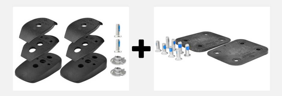
Drive QRS Heel Set

These two components compensate for the height of the Drive QRS24, while giving the advantages of an angled footplate. The system contains all of the screws, washers and nuts to allow immediate installation of the system onto any foot plate wit a standard drill pattern.